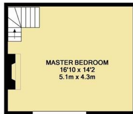
2ND FLOOR APPROX. FLOOR AREA 239 SQ.FT. (22.2 SQ.M.)

TOTAL APPROX. FLOOR AREA 1004 SQ.FT. (93.2 SQ.M.) Schematic Diagram only - Not to scale Made with Metropix ©2018